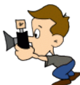
Photo Orders: The deadline to drop off photo order forms in the main office was Friday, Oct 14. If you have not already done so please bring the order form to the office ASAP. Photo retakes will take place on Nov 11 th . Students are asked to sign up in the main office if they wish to have their photo retaken that day.

Peer Tutors: We are looking for a Grade 11 student who took History in French in grade 10. Information and application forms are available in the guidance area.