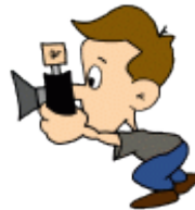
Photo Orders: Students can drop off their photo order forms in the main office. Photo retakes will take place on Nov 11 th .

Writer's Club: Meetings have been taking place in the library for students who want to share their love of writing. Listen to the morning announcements for meeting dates if you would like to join in.